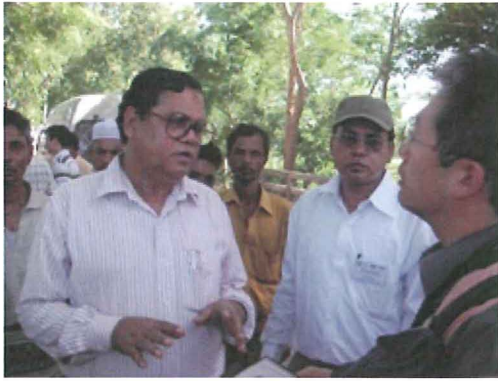
Discussion on site