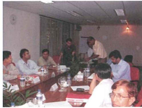
Scene of Workshop