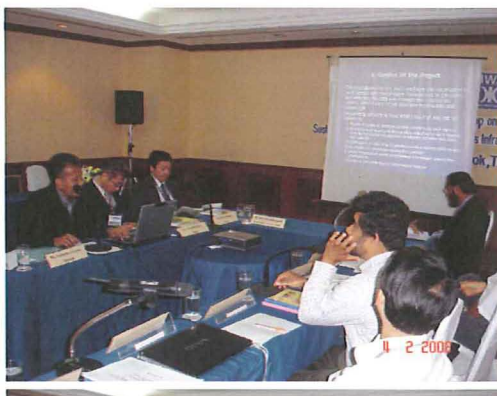
Scene of Workshop

Participants: 14 delegates from 6 countries