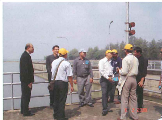
Scene of Study Visit