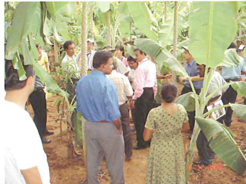
Scene of Study Visit