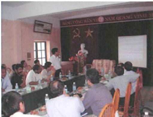
Scene of Workshop

Participants: 16 delegates from 5 countries