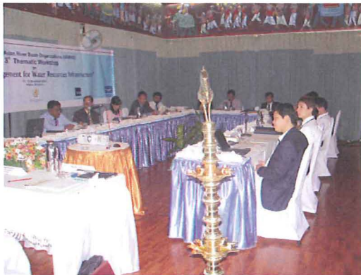
Scene of Workshop

Participants: 9 delegates from 5 countries